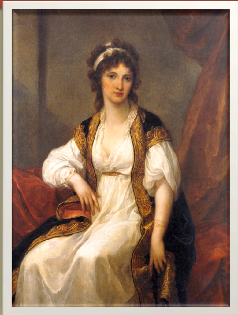
Portrait of a Young Woman Frankfurter Goethe Museum, Germany