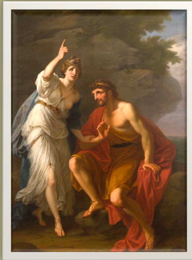
Calypso Calling Heaven and Earth to Witness Her Sincere Affection to Ulysses