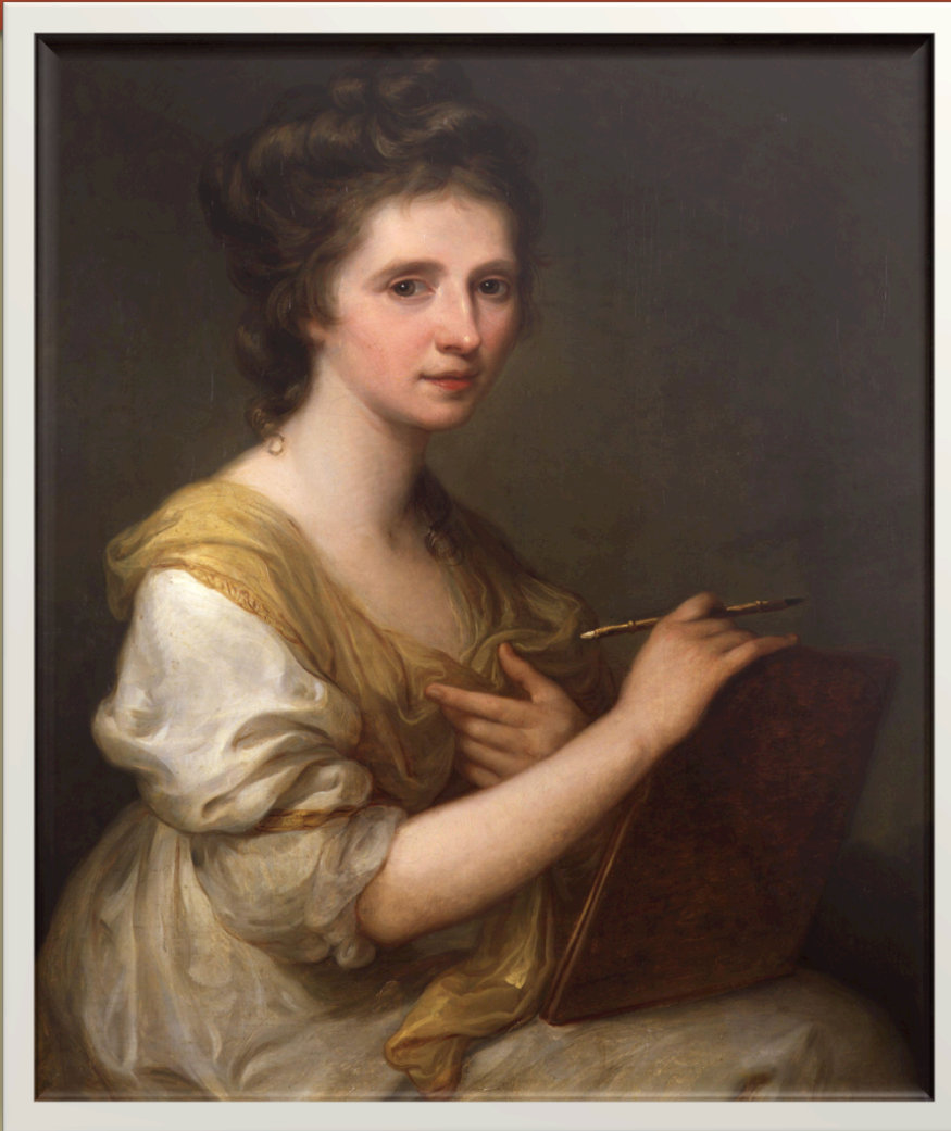
Kauffmann, Self-portrait National Portrait Gallery, London