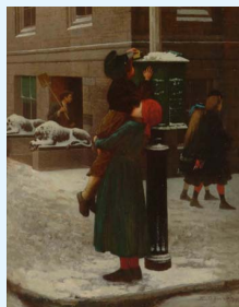
Eastman Johnson, The Christmas Letter , 1867