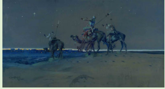
Charles M. Russell, Three Wise Men , 1920.

For too many of us the first “gift” of the season is the stress we feel as we creep through holiday traffic in order to slog through overcrowded malls attempting to find that perfect present for everyone on our list while contemplating the fact that every step is one closer to a metaphorical poor house. No one wants to declare a moratorium on generosity on this most open-hearted of holidays, but we could perhaps sometimes use a reminder that the very best gifts come from the heart and not the wallet. We at the R.W. Norton Art Gallery are fortunate to have had the example of many of the artists in our permanent collection to remind us that the cost of a gift is never the measure of its value.